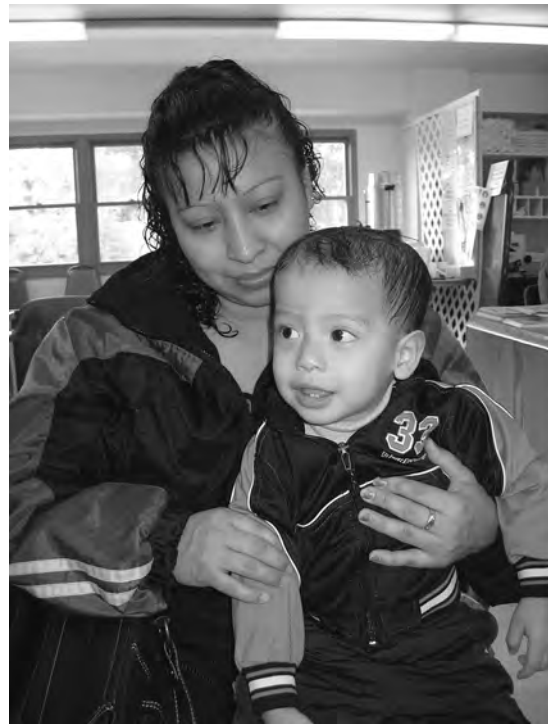
Young family at Fish

“I feel that we are all islands in a common sea.” —Anne Morrow Lindbergh